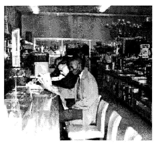
Sit-in at Woolworth's 1959

Kress's, Walgreen's and Burdine's.<sup>4</sup> These public actions were highly visible, intended for the reporter's camera, yet also specific. Each location in the modern city had to be negotiated independently. Each was a separate entity with particular issues.