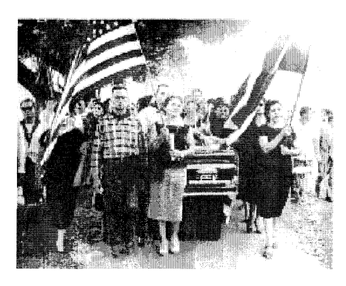
Cuban demonstration in Bayfront Park

Following the disastrous campaign, which had been largely orchestrated by Miami Cubans, the community repeatedly gathered in Bayfront Park to make themselves heard. Needing an appropriate place for a civic event, demonstrators occupied the park as if it were an urban plaza. In March 1962, the Cuban Revolutionary Council, a unified